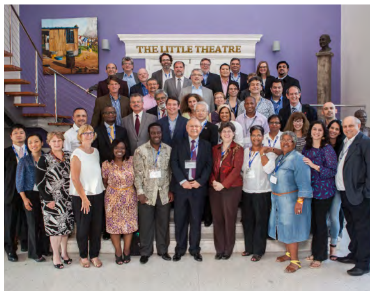
This group of delegates crafted the Nelson Mandela Bay Declaration at the Global Dialogue on the Future of Higher Education Internationalization held in Port Elizabeth, South Africa.

CBIE continues to support members to develop international partnerships and projects.