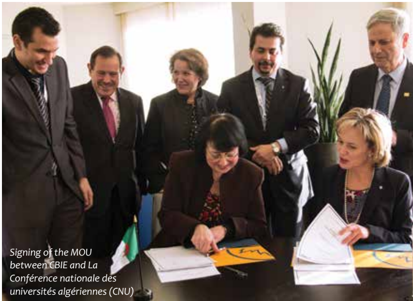
Signing of the MOU between CBIE and La Conférence nationale des universités algériennes (CNU)