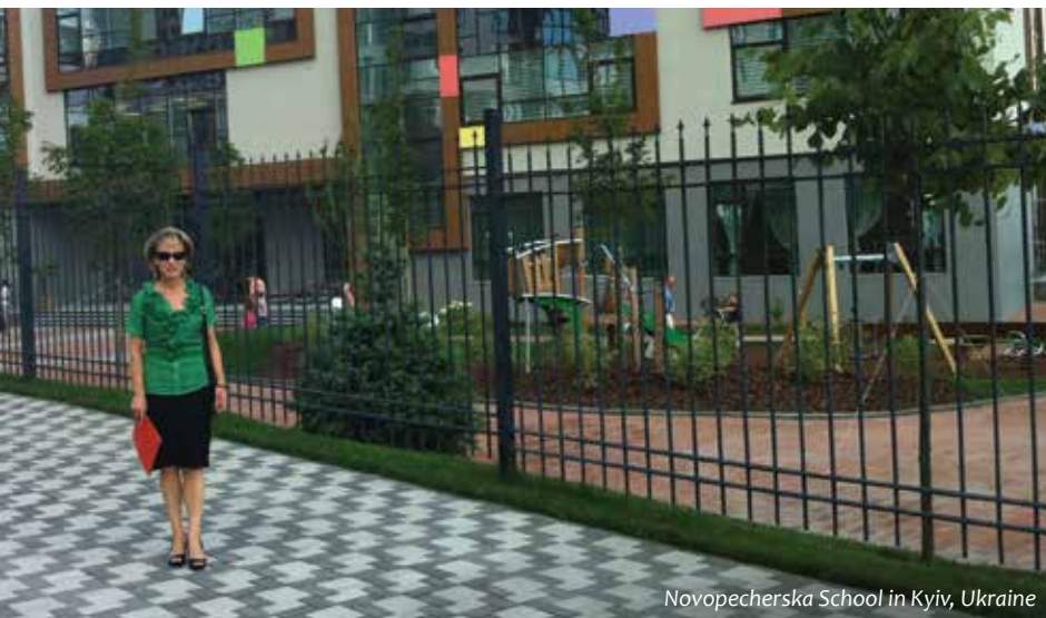
Novopecherska School in Kyiv, Ukraine